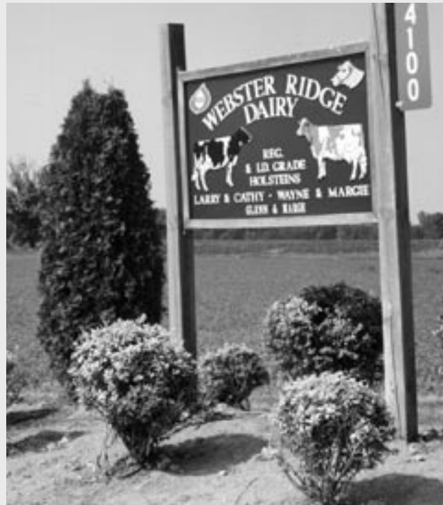
Webster Ridge Dairy is located near the town of Elsie, in central Michigan.

The next step was finding people who wanted to do the jobs, especially milking. About three years after expanding, they had a terrible labor year that again