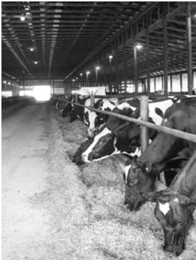
Some free stall buildings feature a center alley for delivering feed.

The free stall environment also allows dairy producers to control variables related to the animals’ health and productivity, to streamline processes, and to become more automated. With good management, cows can achieve consistently high levels of milk output.