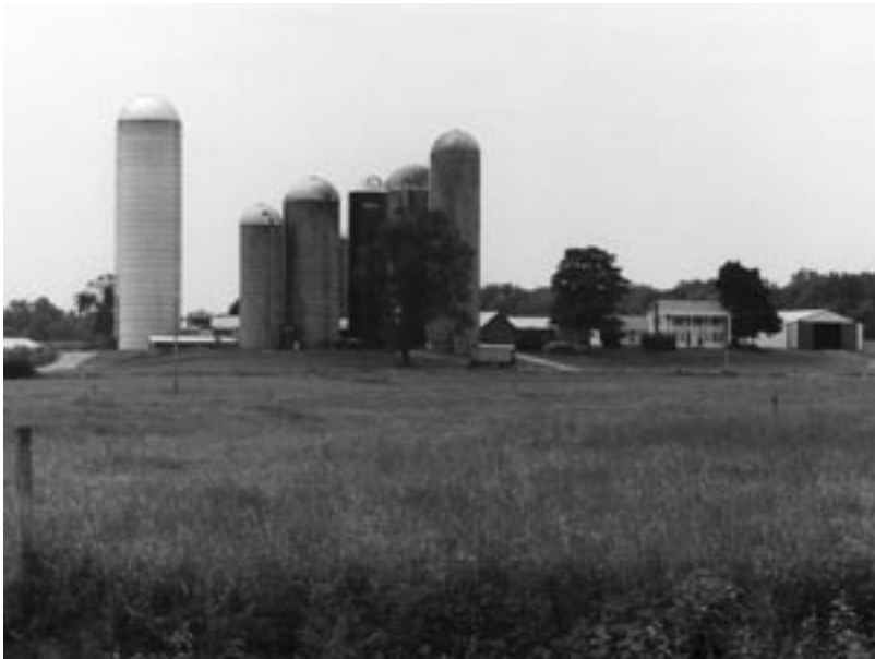
A variety of shapes, sizes, and styles of silos can help tell the history of a dairy farm.