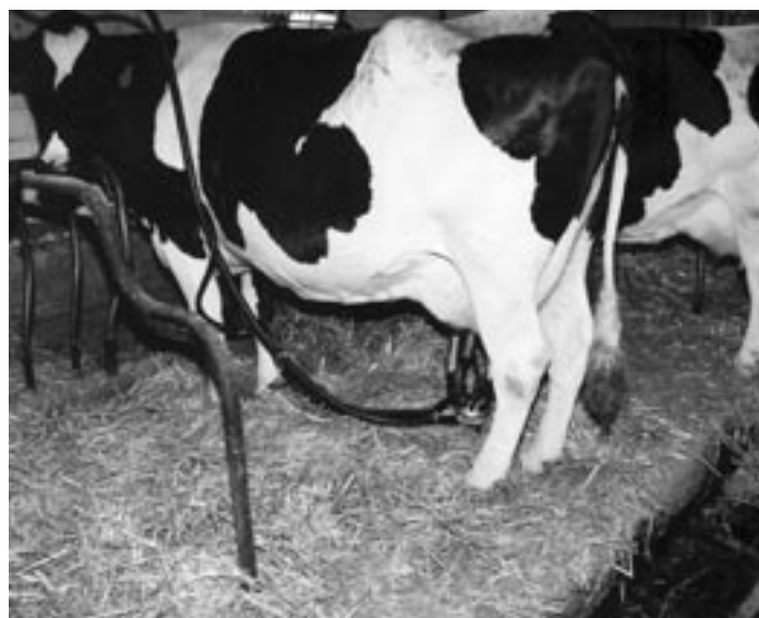
In a tie stall setup, milking units come to each cow in her individual stall.

In addition, nothing separates the cow from the dairy producer, and this proximity can create a safety hazard. The cow may step on feet, kick the person milking her, or crush the milker against the stall sides. Most producers say they feel wear on their bodies as a result of the physical demands of this milking system.