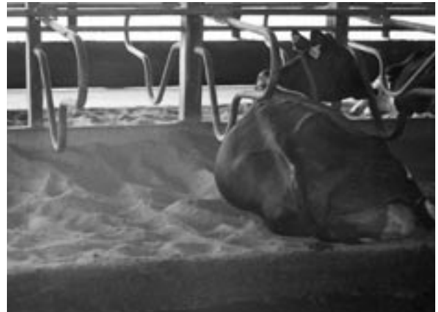
Many freestall operations bed with sand, which is soft for the cows and prevents the buildup of organisms that cause mastitis.

In a modern free stall barn, there are enough stalls for each cow to have her own resting spot, although the cows may not choose the same stall day after day. Often, farmers choose to group animals in sections. For example: cows that are expected to calve soon; cows at the same stage of lactation; cows at the same level of production; or cows of a similar age. The groupings allow specialized feeding for the animals' specific nutritional requirements. In terms of layout, some buildings feature a wide center alley for delivering feed, either along the alley or to internal bunks. While the layouts and investment levels vary, free stall barns all improve labor efficiency and cow comfort when compared with tie stall facilities (Holmes et al., 2003).