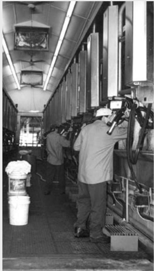
Milkers at Webster Ridge prep cows and attach milking units in the double-16 parlor.