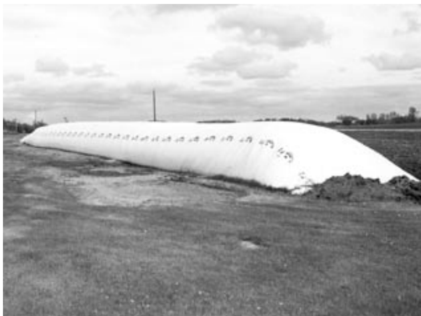
Long plastic bags like these provide economical storage for silage with minimal spoilage.

Buildings usually have retractable curtains along the sides. These are closed for adequate protection from wind in the winter and open for ventilation in the summer. Some buildings have tunnel ventilation, and a growing number use additional fans or sprinklers to keep cows comfortable in the summer.