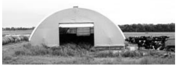
Low-cost building can work well for bedded pack and composting barns.

For farmers considering a bedded pack barn or a composting barn, a number of building design options exist, including hoop structures or greenhouse barns. In a bedded pack barn, bedding is added as needed to keep cows clean and dry. Large amounts of bedding (25 to 30 pounds per animal per day) are required.