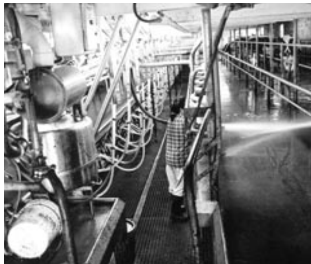
This operation modernized by adding a pit parlor, which improved labor efficiency and milker safety.