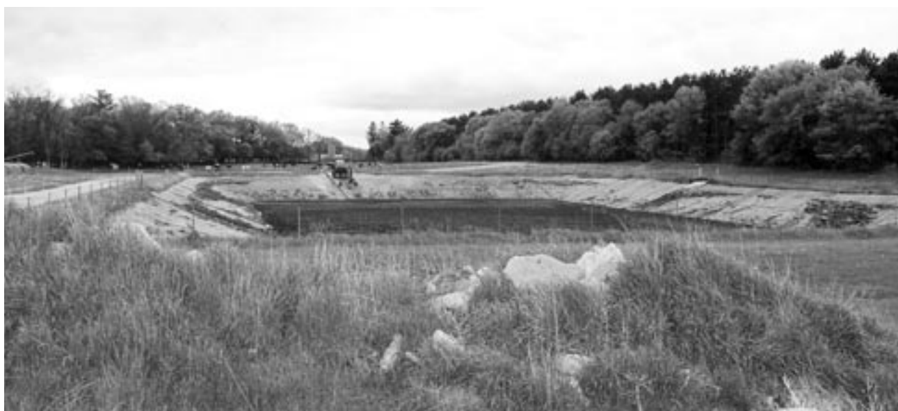
A lined manure storage basin at one Minnesota dairy.