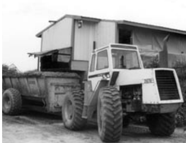
In facilities without slatted floors, manure is scraped and hauled daily.

Some facilities store manure beneath the barn. When producers must eventually empty the storage unit, they can use the manure as a fertilizer and soil amendment for their own farm, or can make arrangements for the waste to be transported to another farm. Manure and soil testing help farmers make the best use of the nutrients. If sand bedding is used, the sand must be removed from the basin using a dragline bucket. Pumping primarily removes the manure and liquids.