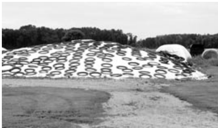
Piles covered by plastic and weighted with old tires provide silage for winter use.

Wherever upright silos are used, silo unloaders are necessary, and these need frequent maintenance and repairs. Some farms opt for other methods of feed storage, which may include bagging haylage and silage in long plastic tubes. Bagging materials are purchased annually, and an initial investment is needed for bagger attachment (Holmes et al., 2003). Other producers may elect to build bunker silos. Well-packed silage piles are less expensive than bunker silos, and require only flooring. These covered piles provide silage for winter use.