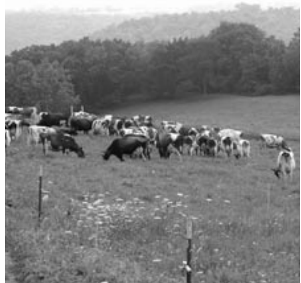
While many people find the sight of cows on pasture picturesque, conflicts with neighbors can still occur.

Neighbors who see cows outside usually find the sight pleasing. Grazing does not ensure that all relations with neighbors will be rosy, however. When the cows get out — as they occasionally do, even with the best maintained fencing system — they can cause destruction to neighbors' property, souring relations. Some neighbors may be intolerant of waiting for cows to cross the road, or may complain about delays in cleaning up manure that is left behind. The neighbor's dogs may find out that it's fun to come onto your property and chase your cattle. Disagreements about fences and fencing can also be a problem (Kevin Stuedemann, personal communication, 2005).