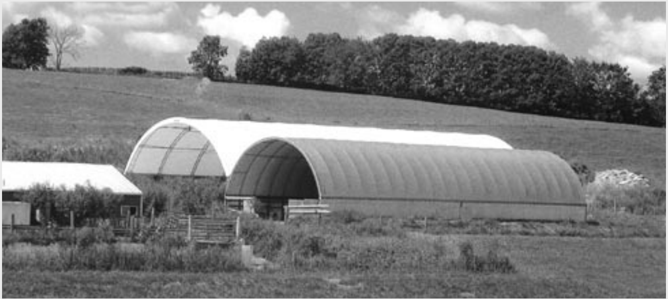
The Vosbergs constructed two canvas hoop sheds to provide shelter on bedded packs during the worst winter weather.

During the design of the pasture and fencing, Dan planned paddock size and shape to fit topography. To avoid erosion, he didn't want to put lanes on steep hills. In the spring, he follows a two-week rotation among his 25 paddocks, sometimes subdividing them with polywire. In the fall, he extends the rotation to 40 days and feeds supplemental hay if needed.