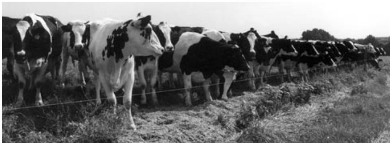
Some grazing operations offer supplemental feed and minerals along fence lines.

Grazed herds are often small; usually, they have fewer than 200 cows. Many have fewer than 100. However, herds can be considerably larger. Productivity varies widely. Management decisions, including adding water to paddocks and supplements to diet, play a significant role in influencing milk output. A seasonally calving farm dependent on grass alone may yield 11,000 to 14,000 pounds of milk per cow per year. Herds that are fed additional grain supplements have higher yields and can achieve 17,000 pounds per cow per year (Johnson, 2005 and UMN-CFFM). When herds are moved from confinement to pasture, a farm may see changes in milk yield, with a production decrease most common. In a survey of dairy herds using the grazing method, 29 percent reported a decrease in production, while 22.5 percent reported an overall increase in production (Kriegl et al., 1999).