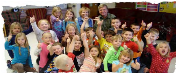
Crawford County Farm-to-School

In addition to offering these broad-reach events, producers on the DWG coalition are directly involved in farm to school programming. DWG farmers sell their products to area school food service departments and speak in classrooms when their products are featured as the Harvest of the Month. Through interacting with vegetable growers to honey producers, students are able to gain an inside perspective on local agriculture, the food system, and the value of supporting their farming neighbors. Accordingly, monthly flyers featuring the farms, fun food facts and recipes are sent home so that the learning does not stop with just the students.