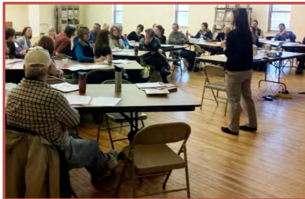
The Columbia County Farm to School Summit underway in February, 2013