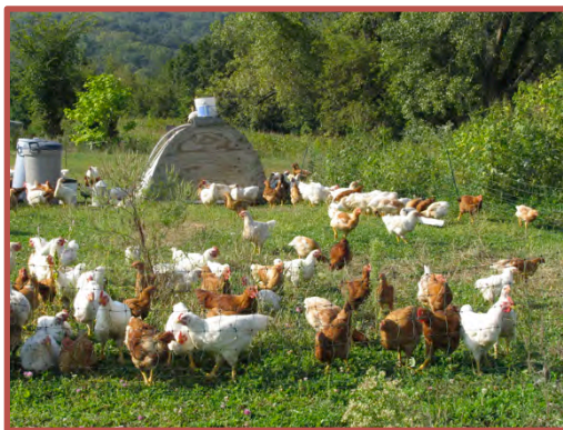
Above: A Harvest of the Month grocery store display in a local Piggly Wiggly. Below: Coulee View Family Farm has worked with Shared Spaces Kitchen to make chicken broth a Harvest of the Month product.