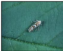
Spotted Tentiform leafminer mid-April