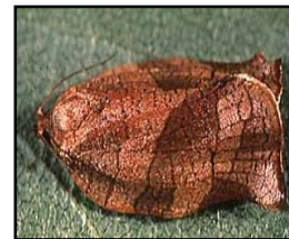
Obliquebanded leafroller mid-June