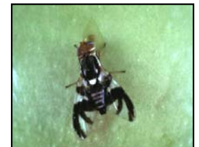
Apple Maggot early July