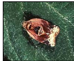
Redbanded leafroller mid-April