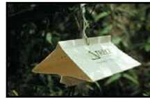
Pherocon Delta Trap