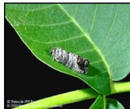
Codling Moth mid-May