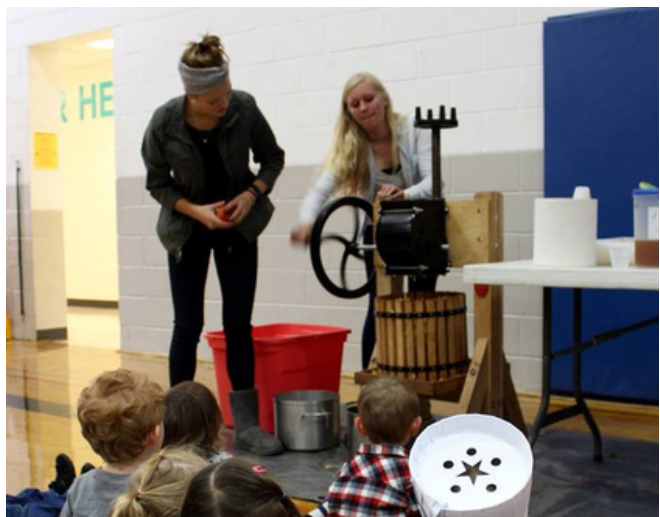
Make apple cider with students!