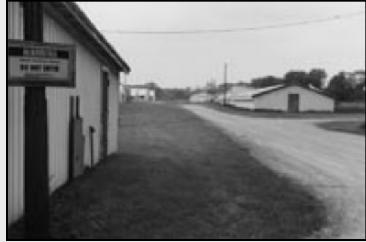
Biosecurity: a warning sign at the entrance reminds visitors of the need for disease control.

The plant was set up to process 4.25 million turkeys a year, producing boned turkey meat valued at about $72 million. Plans included adding further-processed, value-added cooked products under the name “Golden Legacy,” at some point in the future. Those original goals have been met or exceeded, Lennon said. Despite some bad years for turkey since 2000, the plant has sold at least $72 million worth of products each year. Running one full shift a day, it processes 4.5 million birds a year. It has captured contracts with the state of Michigan’s Department of Corrections to provide cooked and raw turkey to state prisons. It has contracted with other companies to prepare cooked turkey products valued at about $10 million a year. It has added one grower member to the original 15, and several growers have expanded production.