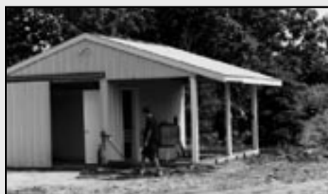
The Joneses’ new processing facility.

Currently, birds are killed and bled in four killing cones, then transferred to a scalding tank for 30 seconds in 140-degree water. Scalded birds go into a seven-bird-capacity picker and then onto a stainless steel table for evisceration. The last stop is an ice-water bath for cooling, but Frank and Kay don’t like water cooling and plan to change that.