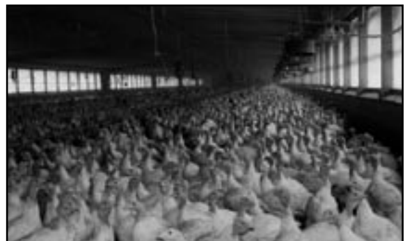
Nearly fully grown turkeys on the Bussis farm. At this stage, Joel can move slowly among the birds to monitor their condition.

Clean-out. Once your birds are headed to the grow-out house or processor, clean-out must begin. Growers are responsible for cleaning out, washing, and disinfecting barns as well as disposing of manure and litter after each batch of birds has been removed. Manure and litter packs are often removed with a skid steer loader or other equipment and hauled off-site for biosecurity reasons. Broilers deposit four pounds of litter per bird over an eight-week period (Mercia, 2001).