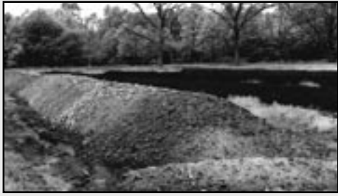
Turkey manure composting. Joel Bussis markets the compost to local farmers.

The compost is short one element—water. “The manure cake is quite dry, 17 to 22 percent moisture, and the brooder manure is drier still,” Joel said. “You need 40 to 50 percent moisture to get a good heat going.” He piles the manure into windrows and waits for rainfall to raise the moisture level. A 1,500-gallon water wagon can be used to add water if needed. Composting is a key part of the operation, for without a good waste disposal system the operation is not viable.