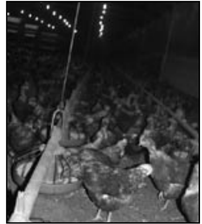
Layers at feeders.