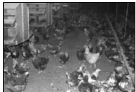
Layers in traditional housing.

If you are a prospective poultry grower, you will need to become familiar with a few management basics before studying the details of a particular management system. These basics include poultry housing, equipment, supplies, flock management, and labor. Under flock management we address poultry feed, water, and health at different stages of production (brooding, laying, grow-out). Many commercial growers purchase day-old chicks or immature birds (such as pullets) from hatcheries when new birds are needed. If you are interested in raising your own replacement birds or managing breeding stock, see Resources under Species/Class/Breed Information for a list of recommended publications.