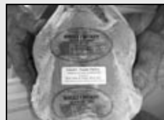
Organic certified chicken packaged for market.