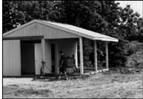
New on-farm processing building on Jones farm (see Farm Profile: Management Alternatives–Day-range).

On-Farm Processing. On-farm processing is a somewhat unique opportunity for poultry producers. Birds are relatively easy to handle (even turkeys) when compared to other livestock. Most on-farm processing is done manually. Processing volume — more than anything else — will affect labor requirements, equipment choice, facility design, and legal obligations. Two on-farm processing alternatives, manual and mobile, are well-suited for growers interested in butchering 20,000 birds or less each year and are reviewed briefly below. Use this information to begin narrowing your focus, then see Resources under Processing for more information about the alternative that seems most suitable for your operation.