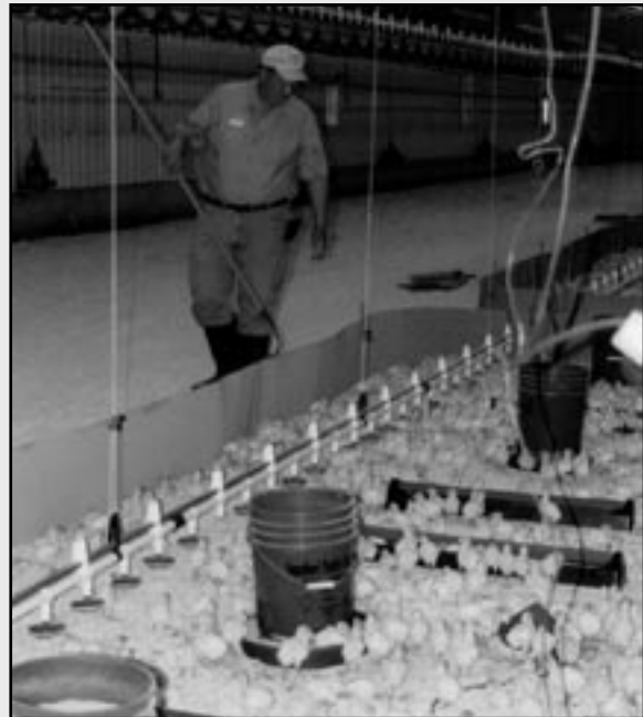
Two-day old turkey poults in brooder house, 720 poults within each ring.