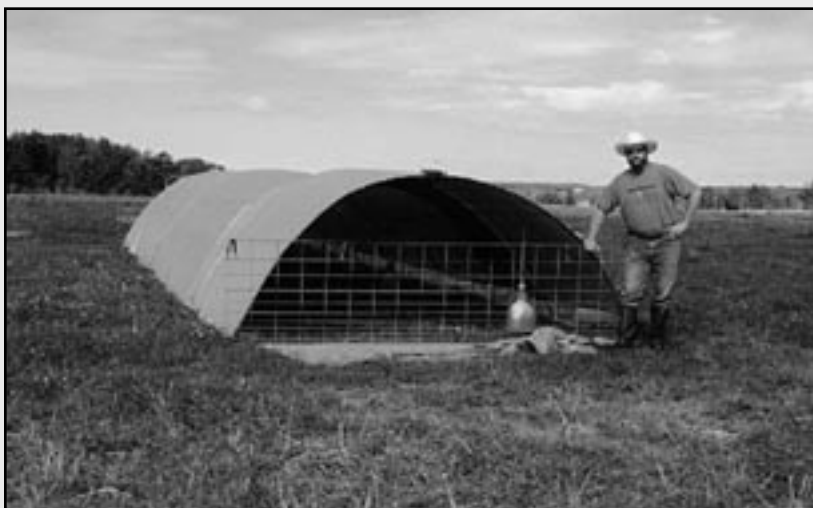
The Hansens’ pasture shelter consists of wire cattle panels covered with a tarp. It is designed to be moved to new pasture weekly, rather than daily.

After some trial and error, he settled on pasture cages made of cattle and hog panels. Two 16-ft wire cattle panels are bowed over a pair of 2 ft by 4 ft frames spaced 12 feet apart. Hog panels are placed on the other two sides, with chicken wire preventing birds from escaping through gaps in the panel wires. About half of the side and roof area is covered with a tarp. Positioning the pens so that the tarp is to the windward side has prevented the hoop houses from being turned over in even the highest winds, Mike said. The structure, which weighs about 125 pounds and requires less than $100 in materials, can be moved by hand with a dolly.