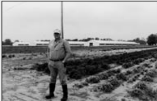
Layout of the building complex. Open land is rented out to a grower of plant nursery stock.

The plant originally hired 215 line employees and 55 in sales and management—many of them experienced Bil-Mar workers. It now has 400 employees. The facility cost more than $20 million to build. Funding came from CoBank, part of the Farm Credit System, on condition that the co-op members raise half the money. The 15 grower members contributed most of it, but some came from outside investors. Several of the grower loans were guaranteed by the USDA’s Rural Development Agency.