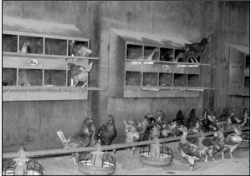
Inexpensive laying facilities include wall-mounted egg boxes and a recycled feeding system housed in an old hog building.