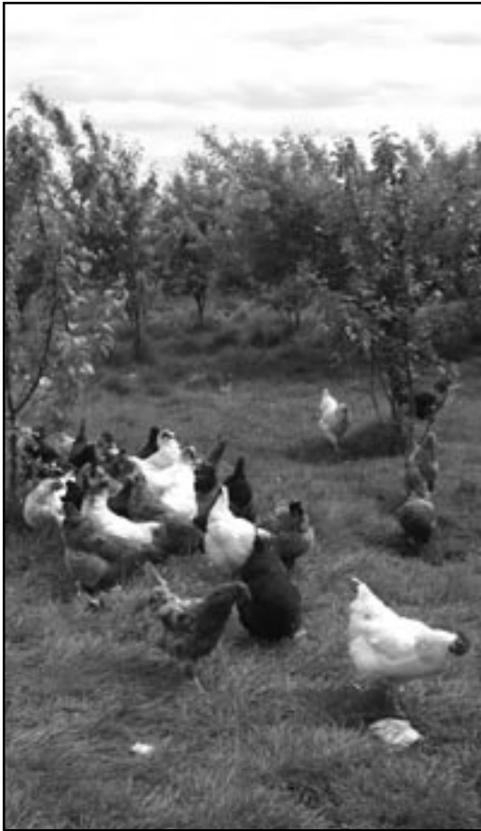
Day-range chickens on pasture.

Poultry Marketing Alternatives begins with basic background information about poultry meat and egg markets—customers, products, and relative prices (when available). In Poultry Processing Alternatives we discuss on-farm and off-farm processing options, as well as the legal considerations associated with each. In the next chapter, Poultry Management Alternatives , five poultry production systems are described: (1) Industrial Management; (2) Traditional Management; (3) Day-range Management; (4) Daily Move Pen Management; and (5) Organic Management. Accompanying each management description are real-life profiles of successful poultry farmers in Michigan, Minnesota, and Wisconsin. In the profiles, growers talk about how a particular management system is working on their farm, what types of challenges they've experienced, where they market, how they get their poultry products to market, and what they might do differently next time.