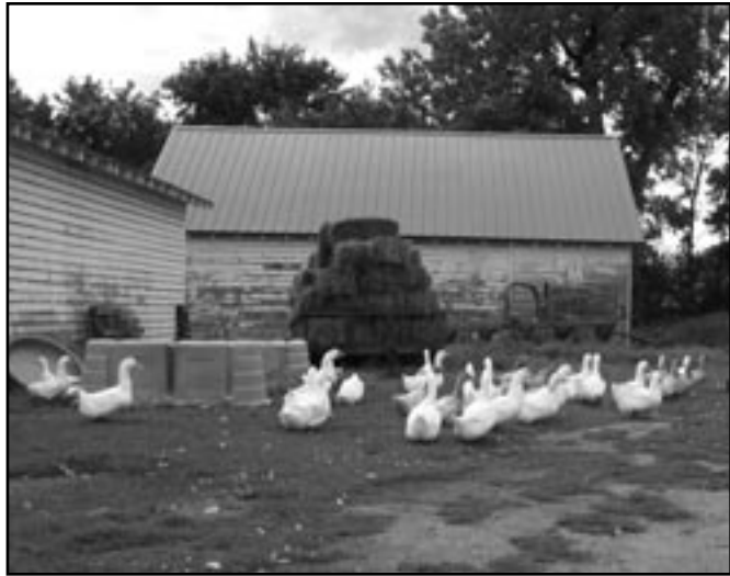
Geese foraging in barnyard.

The major drawback of waterfowl production is the expense associated with processing. Because of their thick down and oily feathers, waterfowl are more difficult and time consuming to process (Salatin, 1999a).