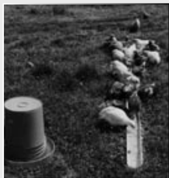
Feed and waterer in pasture.