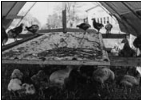
Machine-portable broiler house.

Housing. Regardless of whether you raise chicken broilers or laying hens, turkeys, or ducks, day-range housing needs to be portable, weathertight, and predator proof. All shelter designs have doors or access holes to a fenced pasture area. Pastures are enclosed with electric, predator-proof perimeter fencing and divided into paddocks using one-inch poultry netting. When it comes to the perimeter fencing, livestock specialist David Pratt said “More elaborate designs are often needed for predator control. A high-tensile fence design that has effectively prevented dog and coyote predation consists of nine wires mounted at heights of 5, 11, 17, 23, 30, 37, 44, 52, and 60 inches. Every other wire is electrified (including both top and bottom wires). Wood posts are spaced 75 to 100 feet apart with fiberglass stays installed at 20-foot intervals.” Contact the Center for Integrated Agricultural Systems (see Resources under Agencies and Organizations ) for more information about pasture fencing and installation.