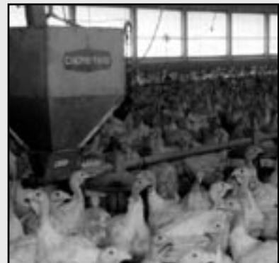
These turkeys are close to market weight of 40 pounds.