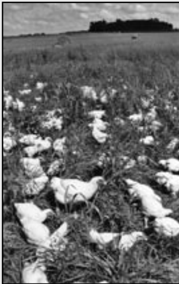
Cornish Cross broilers on pasture.