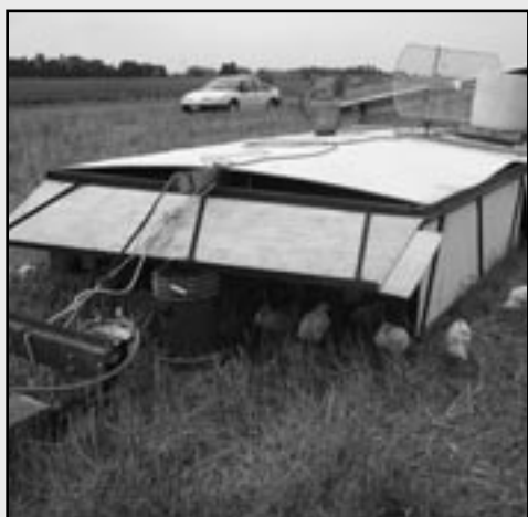
Layer shelter on skids that gets moved every three to five days.