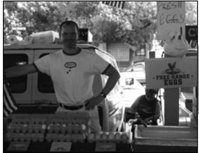
Pease eggs at Minneapolis Farmers' Market.

Table eggs. Farm-fresh eggs are usually one of the first things to sell out at farmers' markets. On average, every American consumes 250 eggs annually (USDA, Economic Research Service, 2004). That's a lot of eggs! If you're thinking about tapping into this market be sure to explore customer preferences for egg variety (chicken, goose, duck), color (white, brown, blue), nutritional content (Omega-3, cholesterol—see Figure 10), size (small, medium, large, extra-large, jumbo) and packaging (bulk, half dozens, recycled packaging). All retail eggs come sized and graded by freshness, interior egg quality, and shell appearance.