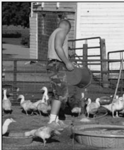
Mash time for Muscovy ducks.