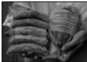
Wild game products.

Other specialty birds, particularly within Asian markets, include squab (young pigeon) and black skinned chicken (see chapter on Poultry Marketing Alternatives for more information).