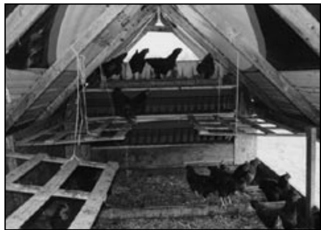
Machine-portable layer house with roosting bar.

Layer house. Either of the broiler housing options described above can be used for layers in the day-range system. However, you will need to reduce your stocking density, build-in nesting boxes, and add roosting bars for hens and turkeys. Lee and Foreman recommend roosting space of 7 linear inches per hen and overall floor space of 1 to 1.25 square feet per bird during summer (more space is required for the larger dual-purpose breeds). Plamondon recommends 2 square feet per hen. As the weather turns cold and your birds spend more time inside, you will need to give them a little more space. When there is enough insulation and ventilation to eliminate condensation, approximately 2.3 square feet per hen is recommended. If you are not controlling ventilation, then 4 to 5 square feet is advised (Plamondon, 2003).