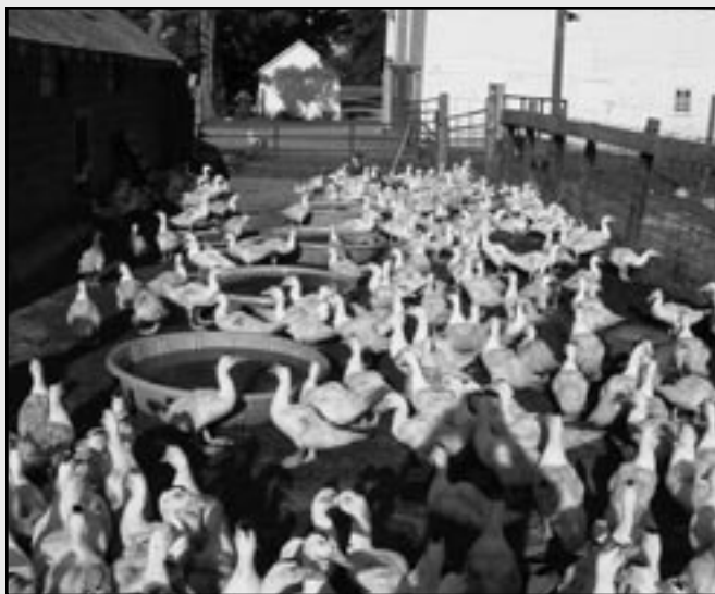
Muscovy ducks in fenced yard with pools.

to a standard old barn with a cement apron outside. Inexpensive plastic swimming pools (one for every 100 ducks) provide the ducks with a place to swim. “When they’ve been in that barn for two to three weeks, eight to nine weeks of age, we’ll take them back to a very large fenced area to roam at will. We don’t bother to round them up at night, or pen them up,” said Gerald. This fenced area is at least an acre in size and holds about 500 ducks at a time.