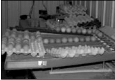
Processing and sorting for sale on Schlangen's farm.

Candling. Candling, the use of a light to see through egg shells, is a well-known method for checking interior egg quality and fertility. Farmers use candling equipment to check eggs for cracks, blood spots, embryo development, and air cell size (air cell size measures freshness). Brown eggs are considerably more difficult to candle because blood spots tend to blend in and air cells are harder to detect. Candling is not necessary when selling eggs on the farm, or in some states, such as Wisconsin, when selling to your customers at farmers' markets. Be aware, however, that brown eggs have a higher tendency for blood spots and a single "bad" egg can turn off customers. For this reason, candling, even though not required, may be a good idea.