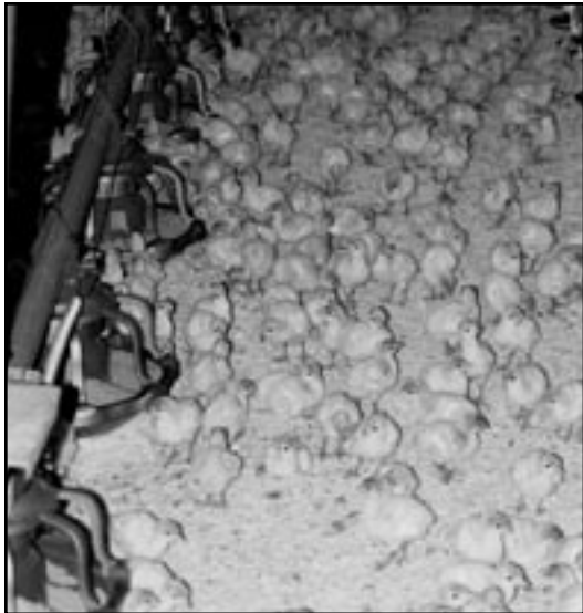
Turkey chicks in brooder house.