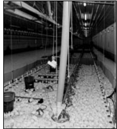
Turkey chicks in brooder house on Bussis Farm.

Turkeys are almost always sexed. Males and females are brooded separately and grown-out separately. This method is more practical with the longer grow-out period. To minimize health risks, brooders are reared and housed separately from the more mature grow-out birds (young birds are susceptible to pathogens carried by older birds). Housing construction is similar for both brooding and grow-out. Industrial houses or barns are usually built new on hard ground or cement pads, insulated, and equipped with automated feeding, lighting, and ventilation systems.