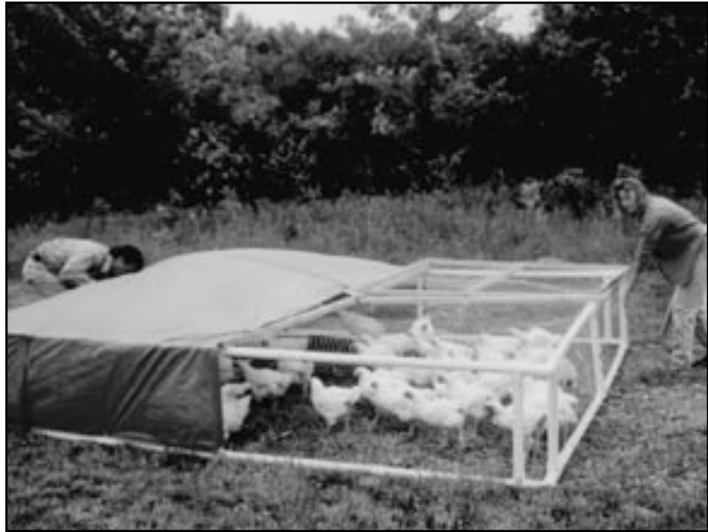
This daily pen was used by Frank and Kay Jones when they first started pasturing poultry. Pens were moved several times a day.

Brooder huts. Salatin recommends brooding birds on pasture and exposing them to cool temperatures at three weeks of age in order to develop hardiness. He constructs semi-permanent brooder huts to accommodate 250 to 300 birds. If raising more than 300 birds at a time and using a large brooder hut or pen, Salatin recommends partitioning off the birds into the smaller groups. He also uses temporary, 18-inch high plywood partitions within the brooder space to confine the birds tightly during the first week. This temporary partition is gradually moved to open up more room for each group of chicks until birds are ready to go out on pasture.