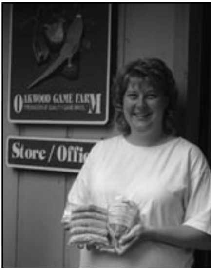
Oakwood Game Farm in Princeton, MN.

Captive Game and Other Specialty Birds. The University of Minnesota Extension Service defines game birds as all fowl for which there is an established hunting season (Noll, 1998). Technically, they are not part of the poultry family, but a growing number of poultry producers are looking at captive game birds as an alternative niche marketing opportunity that offers lucrative supplemental income. Pheasant and quail, for instance, can sell for three to four times the price of chicken in some markets (DiGiacomo, et al., 2004).