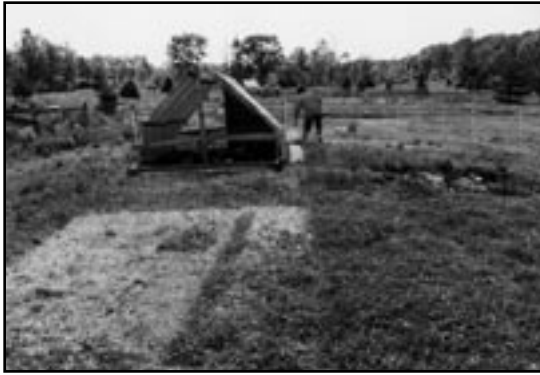
Frank Jones puts out supplemental feed. Portable houses are moved frequently to provide fresh pasture, and limit manure build up.

Domesticated waterfowl, such as “weeder” geese, tend to do well on grass and, because they are easily corralled into shelters, require less labor than most pastured poultry (Manitoba Agriculture and Food, 2002). At about five to six weeks of age, goslings can “subsist entirely on good pasture” (Geiger and Biellier, 1993). Just about any waterfowl breed will perform well since grass is its natural food. Some waterfowl growers recommend choosing breeds that have light-colored skin and feathers because they do not absorb and retain as much heat.