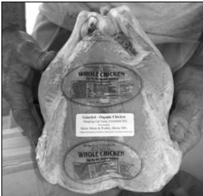
Desenses' organic chickens for sale at the Minneapolis Farmers' Market.

Packaging regulations for poultry and other meat products were established to maintain freshness, quality, and food safety. Packaging chemicals and colorants can migrate to food and for this reason are considered an indirect additive. All additives must be approved by the U.S. Food and Drug Administration (FDA). Poultry and other meat processors are required to use FDA-approved packaging materials and maintain on file a “statement of assurance” or guarantee from the packaging supplier to verify that packaging meets codes under the Federal Food, Drug and Cosmetic Act (USDA, Food Safety and Inspection Service [FSIS], 2000).