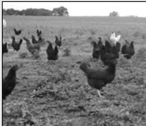
Layers on pasture on the Desenes farm.

His ruminants are fed grass only, and the poultry get as much grass as possible. "The laying hens we want to have out on pasture as much as possible. We're building shelters that are sufficient for them to stay out there all winter."