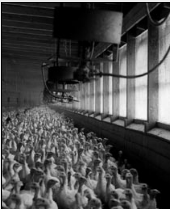
Feeding system, waterers, heaters, fans for ventilation and side curtains in a grow-out building.

Mortality is a fact of life with poultry, Bussis said. What has to be prevented is catastrophic loss. The farm has “stand-by generators in case of electrical failure. “When I was young and we were producing eggs, we lost 40,000 pullets in cages in a power failure,” Joel said. In heated, ventilated brooder barns, heat and ventilation systems have to work.