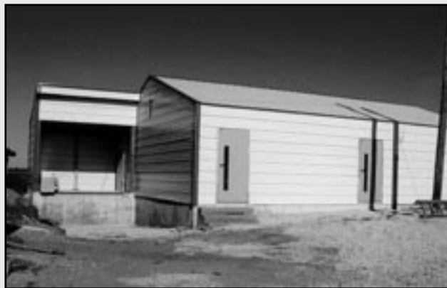
New Century Farm’s new egg processing and storage building under construction.

From the start, Dean’s production model was driven by his goal of developing egg marketing into a year-round enterprise that could provide a full-time family living. Dean felt that a pasture-based production system that kept groups of layers housed in portable buildings regularly rotated among grass paddocks, would not meet his marketing goals. He said the farm is too small for pasture programs that have capacities of 250 to 450 birds per acre. Also, weather conditions in southern Wisconsin normally allow layers to be pastured for little more than six months each year. Dean views pastured poultry as fitting within a diversified marketing program in which eggs are a seasonal product.