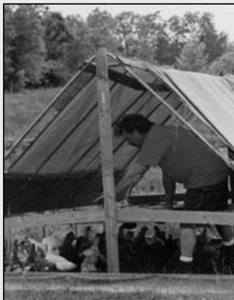
Frank Jones checking on birds in machine-portable broiler house.

Eggs are gathered once a day, and dirty eggs must be washed. Designing the nests so eggs roll away after they are laid helps keep eggs clean. Frank enjoys building things, and part of his day is devoted to making feeders or building houses, roosts, and nests for layers. House construction is simple—two-by-fours, chicken wire, conduit bent into the proper shape, plastic tarps for roofs.