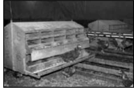
Nesting boxes in Schlangen retrofitted barn.

Old barns and outbuildings may be retrofitted by adding utilities, feeding stations, nesting boxes, roosts, vents, lights, and heat. Minnesota grower Alvin Schlangen, for instance, converted his ten-year-old 48 ft by 368 ft high-rise style barn (originally built to contain 80,000 caged layers under contract with an integrator) to a multilevel house for 6,000 layers. He lined the walls with a poly-type plastic to improve insulating capacity. He also covered the plywood floor beneath feeding stations with plastic to protect against rot. Alvin cut several side openings in the barn to give birds yard access between May and October. The barn is also equipped with two 24-inch exhaust fans, a 500,000 btu corn-burning furnace, and overhead fluorescent lighting. Alvin added standard galvanized nesting boxes (ten spaces per box), floor pan-feeders, and a nipple watering system. He uses natural convection cooling in summer months to reduce energy demand.