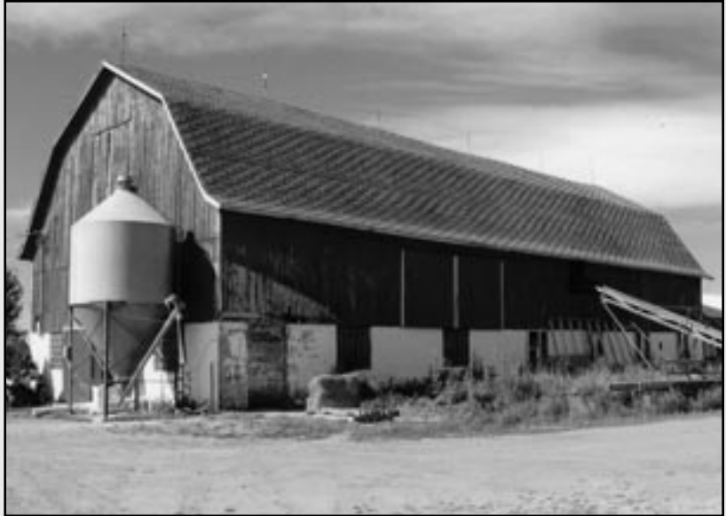
An old dairy barn is home to chicks for the first four weeks until they are ready to go out on pasture.