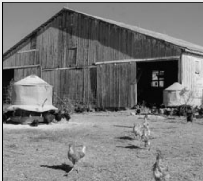
Layers have access to an outdoor run for about half the year.