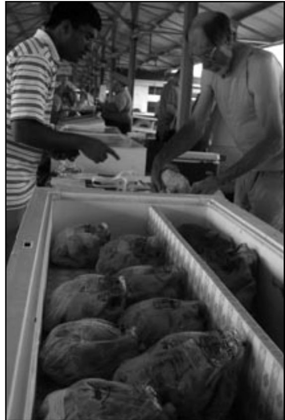
Frozen chickens for sale at Minneapolis Farmers' Market.

Licensing. Farmers who sell eggs from their farm are exempted from obtaining a food handler's license. In most states, a handler's license will be required when selling eggs through an intermediary (retailer, wholesaler, restaurant) or even at a farmers' market. Retail buyers, in particular, are obliged to purchase products only from "approved" sources (in other words, from licensed handlers). Food handler's licenses are renewable annually. Applications can be obtained by contacting your state department of agriculture (see Figure 13).